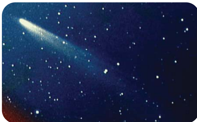
TEMPEL - 1